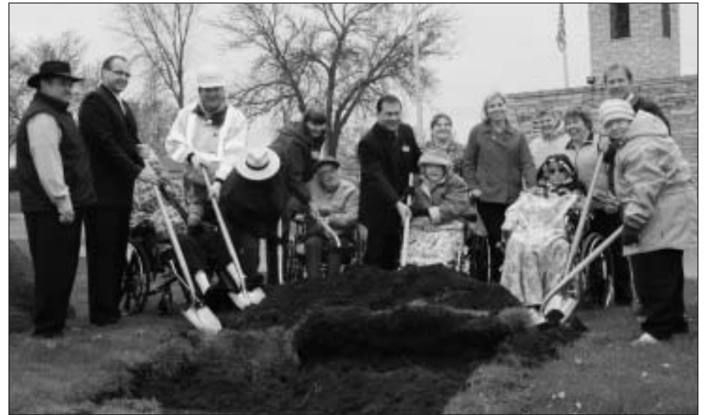
The November 6 groundbreaking participants