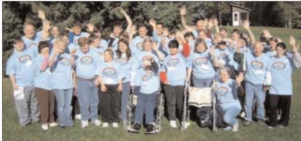
Joy in Jesus Retreat (JCM) - Fall 2007

Twenty two additional locations are asking for our help to start new programs and many are no longer just in the Midwest. With our help, a special outreach effort to serve people with disabilities is under way in our sister Evangelical Lutheran Synod's (ELS) churches. Please rejoice over this min-