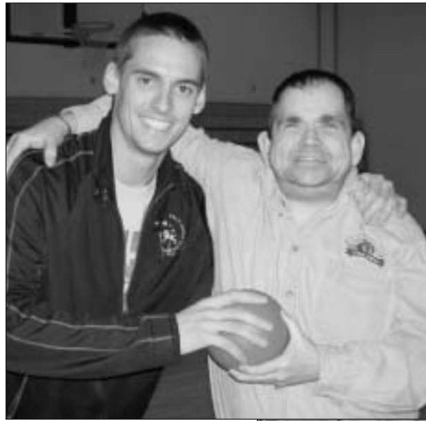
Games and crafts.

It started with that one telephone call from a volunteer who taught a special needs Bible class for a number of years at a large facility. The facility had been closed and the forty people this lady