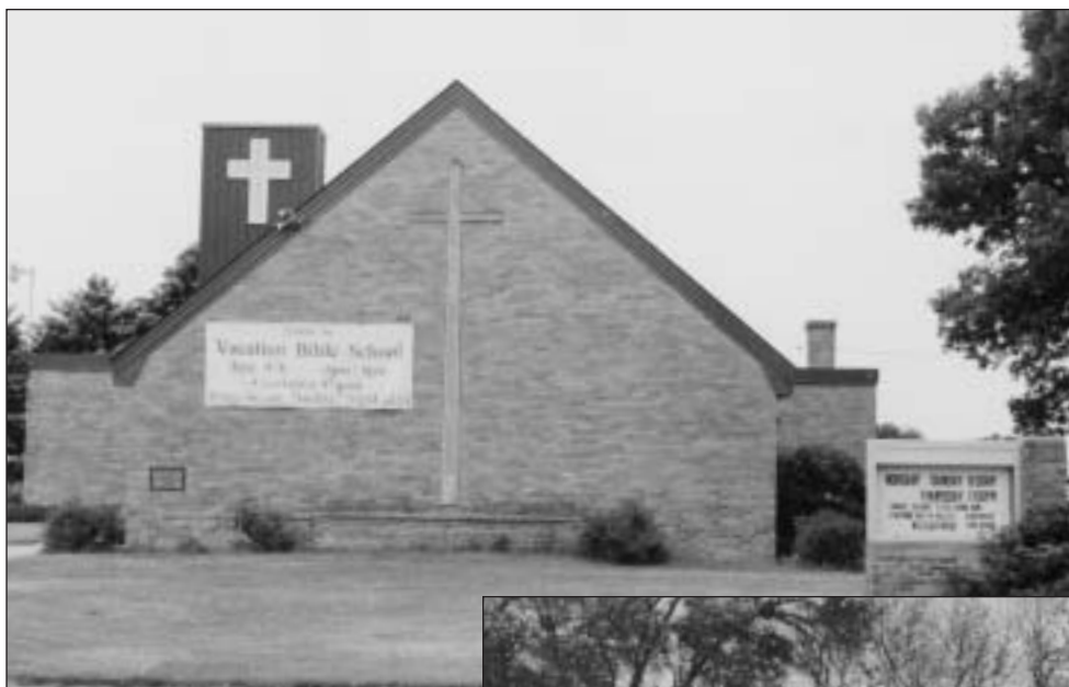
Trinity Lutheran Church of Smith's Mill— Janesville, MN