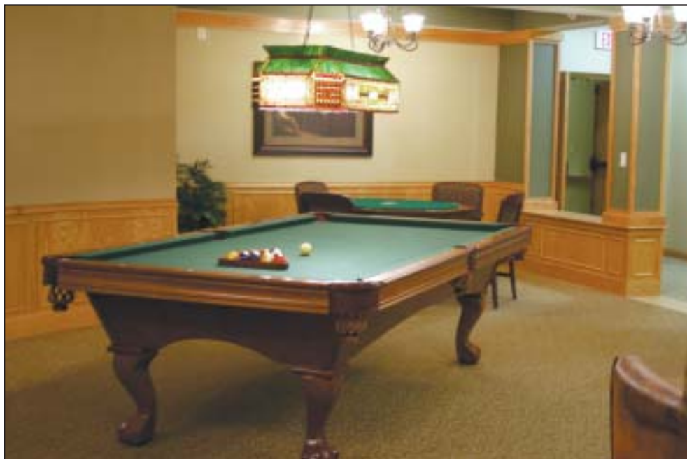
The spacious billiards room is available for residents to enjoy.