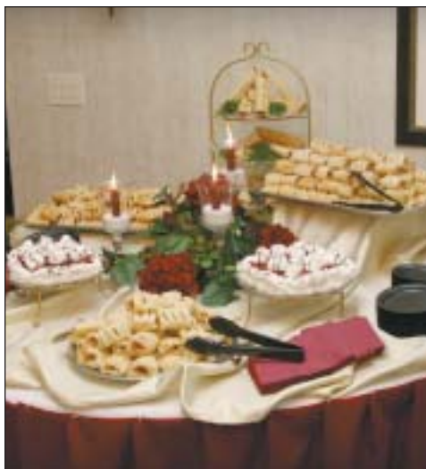
Guests enjoyed delectable treats.