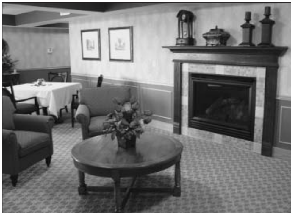
This assisted living dining area showcases Kingsway's old world charm.

Kingsway's assisted living serves those who desire a higher level of service for everyday living. Residents