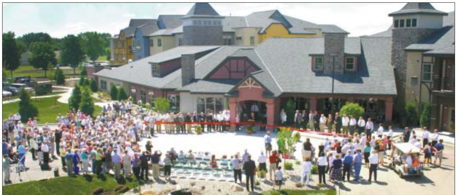
Many attended the ribbon cutting ceremony on a beautiful Saturday.

It was a beautiful summer day filled with a memorable dedication service, a ribbon cutting ceremony, many talented musicians, German Kingsway — Continued on page 8