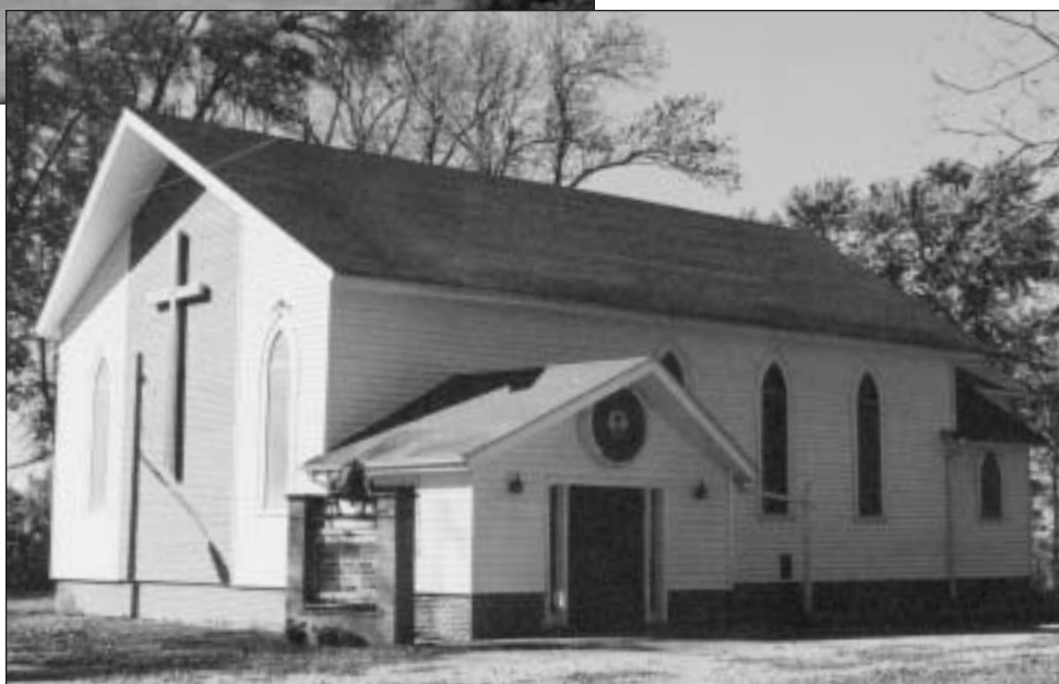
St. John Lutheran Church — Janesville, MN